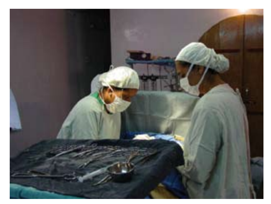
Operation in the Adivasi Hospital

The hospital and the entire healthcare program contributed significantly to the social change for the Adivasis. Here, non-Adivasis have to follow the rules of the otherwise despised Adivasis. Men and women, e.g., are accommodated together in the hospital rooms, unthinkable among the rest of the Indian society. The Adivasis, the lowest rank of the Indian society structure, have the best