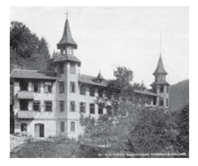
Many of the sanatoria were in idyllic locations. But the isolation was a problem for many. Dr. Walter's Sanatorium in Nordrach

with ΤB suffered Women particularly because of the disease for a number of reasons. Female workers in particular were advised to become sterilized as early as the period of the Second Reich if they became seriously ill with tuberculosis. Doctors frequently recommended termination of a pregnancy because of possible transmission of TB from the mother to the child. There was also the risk that latent TB could develop into active TB as a result of the pregnancy. For a long period of time pregnant women with tuberculosis were not admitted into sanatoriums because it was believed that there was no prospect of a successful cure. If a pregnancy was confirmed during a course of a cure then the woman was immediately sent home. The idea that pregnant patients required special care only gradually became accepted around 1914.26