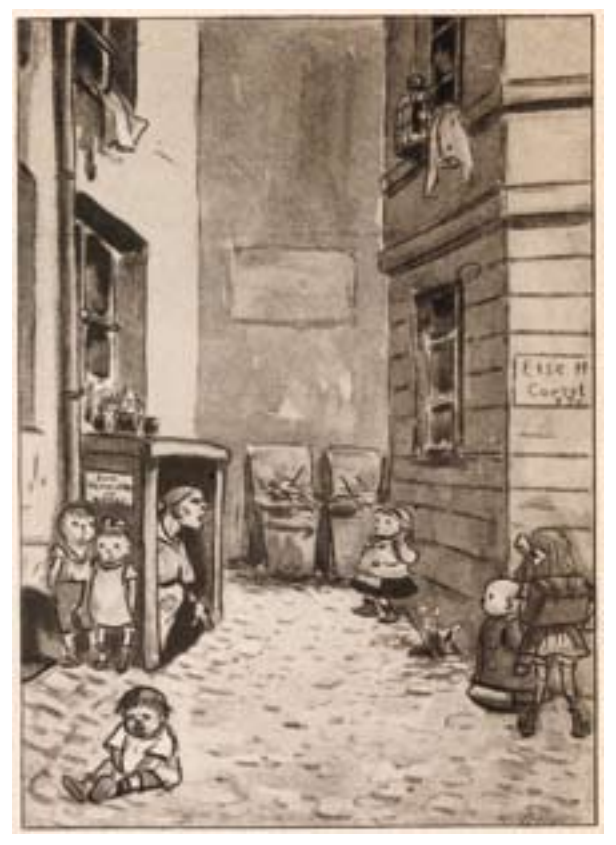
Heinrich Zille: Get away from the flowers and play with the bins!

her four children were sitting on the ground as they all ate boiled potatoes which had just been cooked in a black cooking pot; this was their midday meal without anything to accompany the potatoes.' <sup>6</sup>