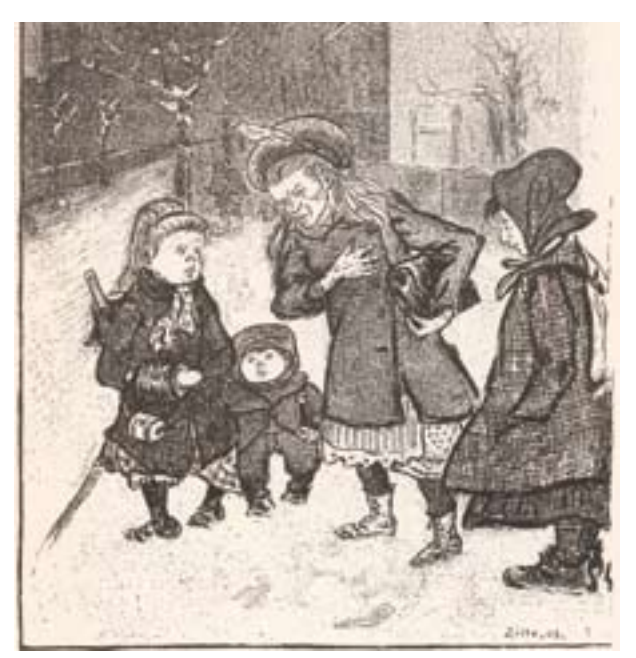
Heinrich Zille: "If I want, I can spit blood in the snow!" (1904)

The blame for the outbreak and spread of TB was placed on capitalism with the disastrous working and living conditions it imposed on working class families. The French trade union, CGT purposefully employed the spectre of tuberculosis as a disease of the working classes in its fight for the 8 hour day and used it in its political agitation on 1st of May.<sup>15</sup> In their weekly magazine 'La Voix du Peuple' a cartoon appeared consisting of two pictures; on the left hand side there was an emaciated man with the caption '10 hours' and an explanation that long working hours contributed to the spread of TB; on the right there was a man bursting with health and energy with the caption '8 hours'.