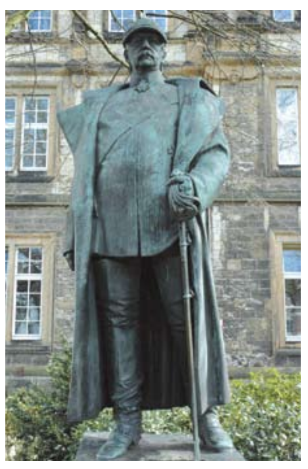
Social reforms to appease the masses. Bismarck monument in Bielefeld.

The cramped and, above all, unhealthy living conditions, insufficient nutrition and poor working conditions encouraged the spread of tuberculosis. According to a handbook on social hygiene written in 1912: "And because these conditions are mostly lacking in the classes of society who rely on manual work