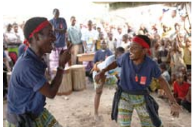
In the middle of the slums of Dar es Salaam in Tanzania men and women perform a play to educate people about AIDS and TB. The Pasada health project is supported by the DAHW.

Being stigmatized because of tuberculosis is very widespread and extends to all members of the sick person's family. The effects are harder for women than they are for men. It is not rare for women to be left by their husbands if they contract the disease, or they have scarcely any chance of getting married and the prospect of social protection associated with it.<sup>62</sup>