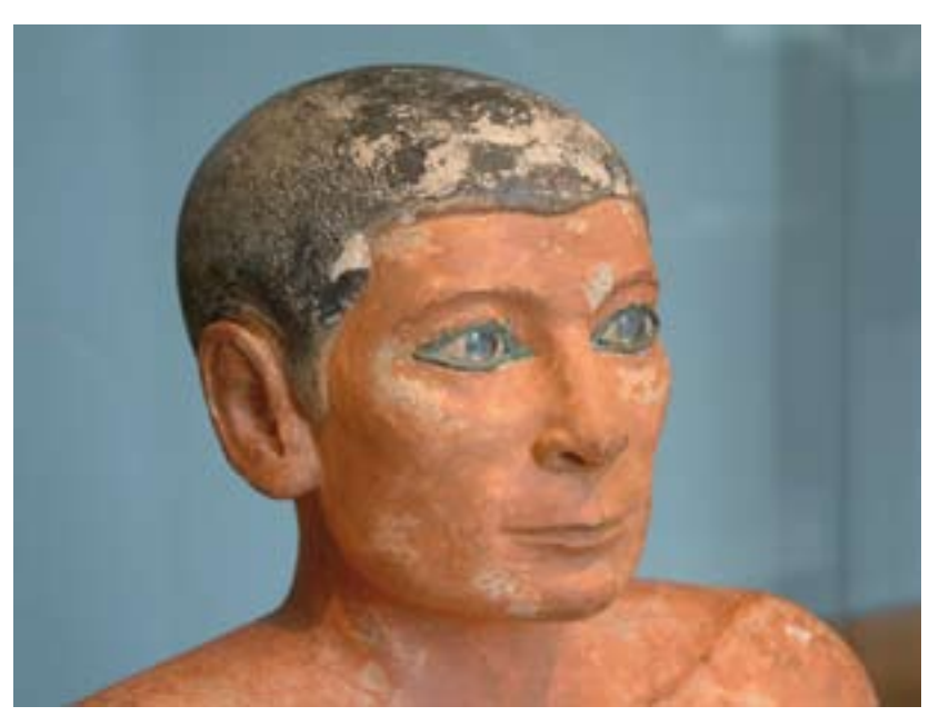
The Egyptian sculpture "The Writer" from the Louvre. Mummies from ancient Egypt document that even then a significant portion of the population suffered from tuberculosis.

Around 200 years ago tuberculosis raged through the whole of Europe. A quarter of all deaths at the beginning of the 19th century were ascribed to consumption. In Southern