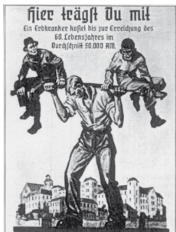
All sick people were regarded as "damaging to the people's community". Nazi propaganda poster

Tuberculosis sufferers were also labelled as a carriers of 'inferior genes' and had to be excluded from the reproductive process as far as possible. It was necessary: 'To evoke the old instinctive aversion to marrying into families with tuberculosis and to warn