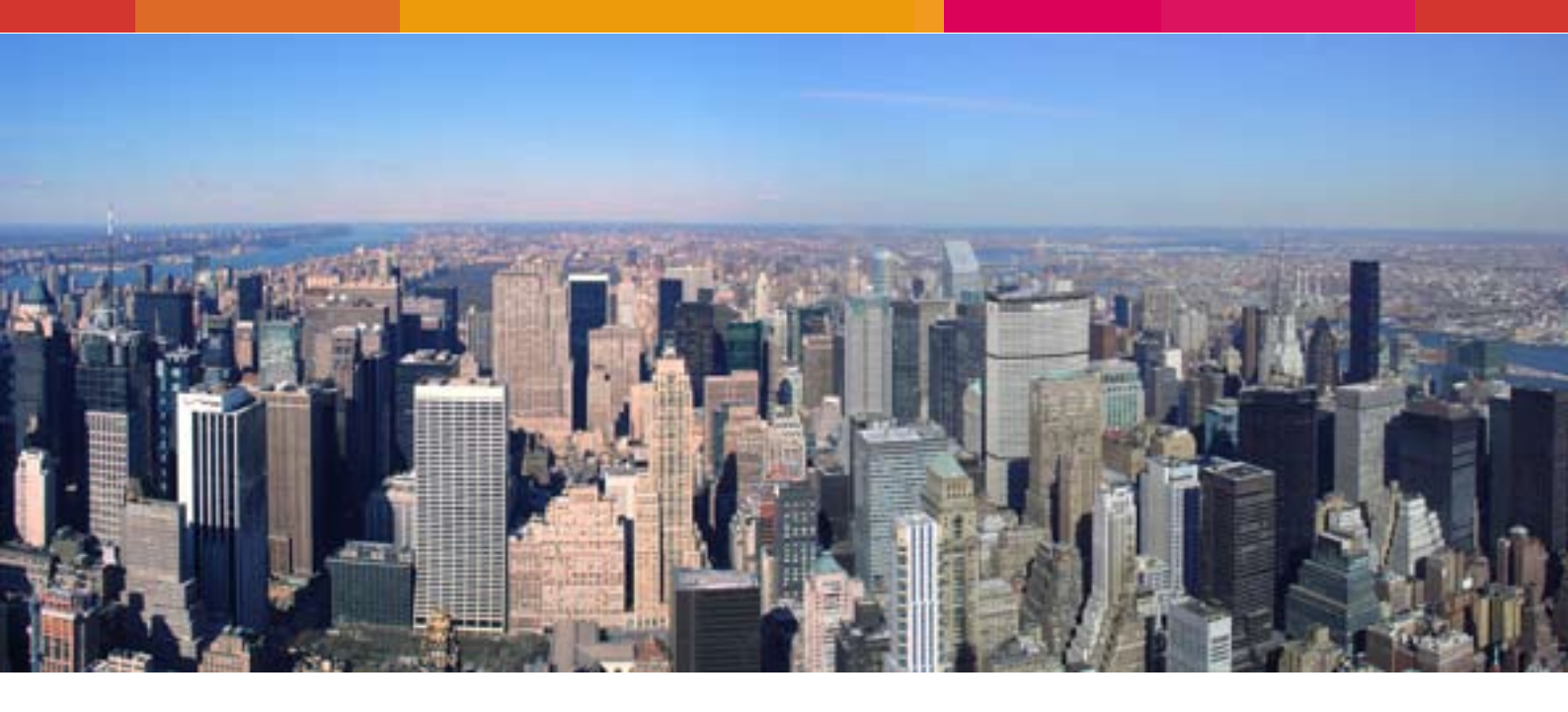
Social inequality and poor healthcare have allowed TB to develop even in Manhattan.