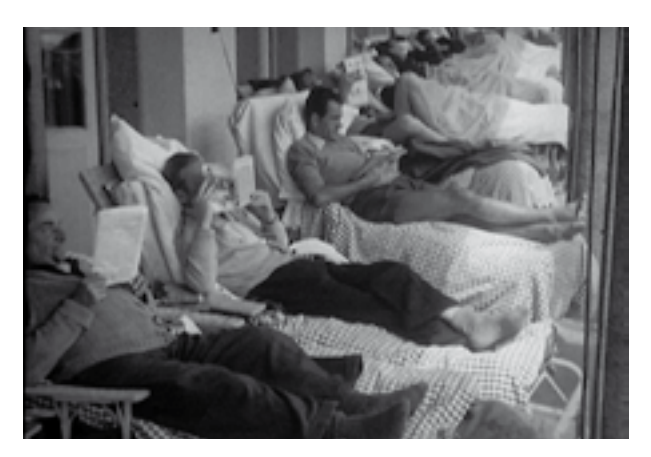
For a long time, rest cures were the core of tuberculosis therapy in Germany.

Since the end of the 1880s people's sanatoriums were established to admit poorer people with pulmonary diseases. The sanatoriums were intended to strengthen the patients both physically and mentally, and to restore their physical powers of resistance. Most of all they were to provide education about hygiene and preventative measures to be taken against epidemics.