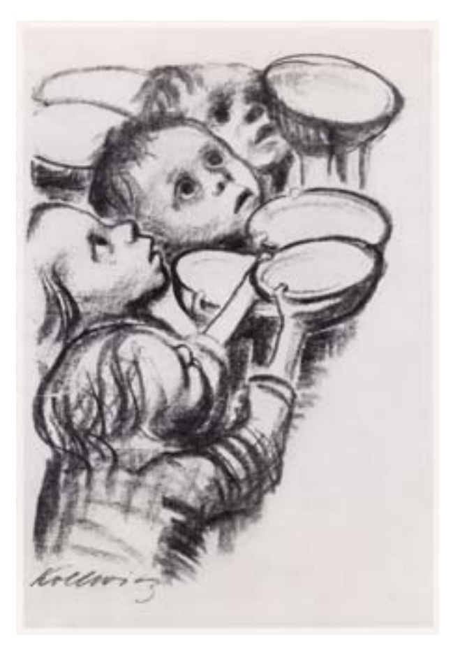
Käthe Kollwitz: Germany's children are starving!

of the amount supplied in peace time. Milk had already become rationed by October 1916 after the supply for Berlin had dropped to 30% of the amount required. There then followed the rationing of eggs, cheese, sugar, fish; shortly afterwards all foodstuffs had gradually become rationed, so that one could justifiably speak of a rationed famine... If the conditions for obtaining nutriment were tolerable until spring 1916, then they became ominous after the winter of 1916/17 following a poor harvest of both grain and potatoes.'<sup>8</sup> The poor nutritional situation endangered not only healthy people,