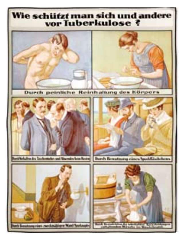
"How do you protect yourself and others from tuberculosis?" Poster from the 1930s propagated by the German Hygiene Museum. The posters were to be placed in highly frequented places such as schools, factories and hospitals.