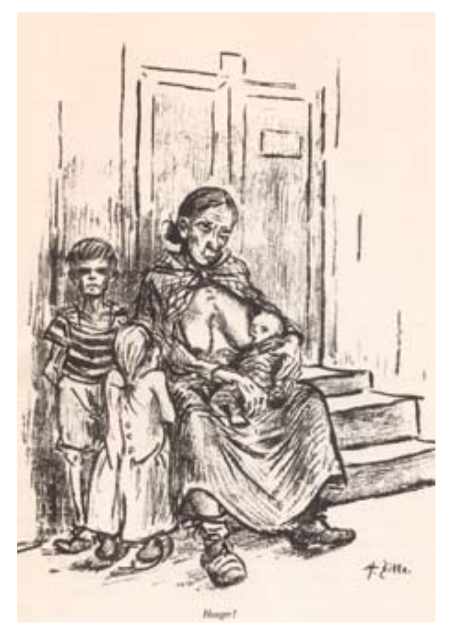
Heinrich Zille: Famine

Here there are some astonishing parallels which can be drawn; the situation of sick people in Germany around 100 years ago in some ways resembles the life of patients in poor countries today.