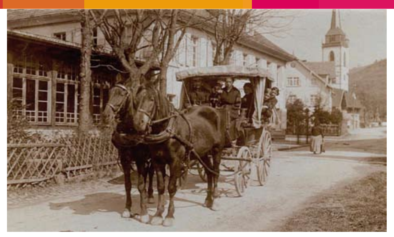
The sanatorium patients were picked up from the train station with horse drawn carriages.