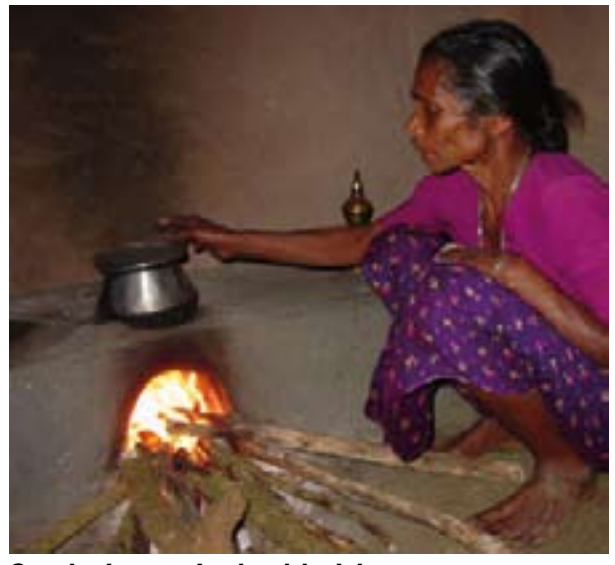
Smoke is a major health risk .

looking for TB cases. Or patients contact the next healthcare centre. In case of suspected bronchitis, they get antibiotics there. If cough, fever or diarrhea continues for more than three to four weeks, the patients are hospitalized. There, we make a sputum test and may also prepare a culture. We can make X-ray pictures in another hospital.Then we start therapy. As soon as we know that the patients tolerate the drugs, their treatment continues at home. Unfortunately, they cannot remain hospitalized for cost