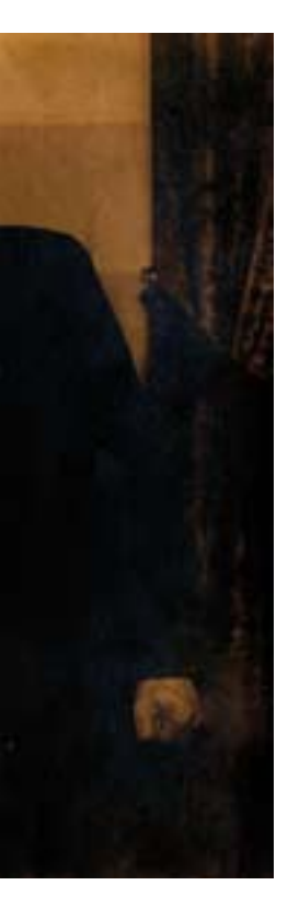
on the 17th of Josis