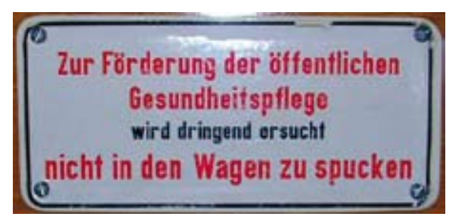
For the protection of public health, please refrain from spitting in the carriage

not breast feed or look after children.<sup>20</sup> This drastic demand must have caused great concern to many patients. In addition to the burden presented TB was now added the worry that their children or their pitiful auxiliary earnings could be taken away from them.