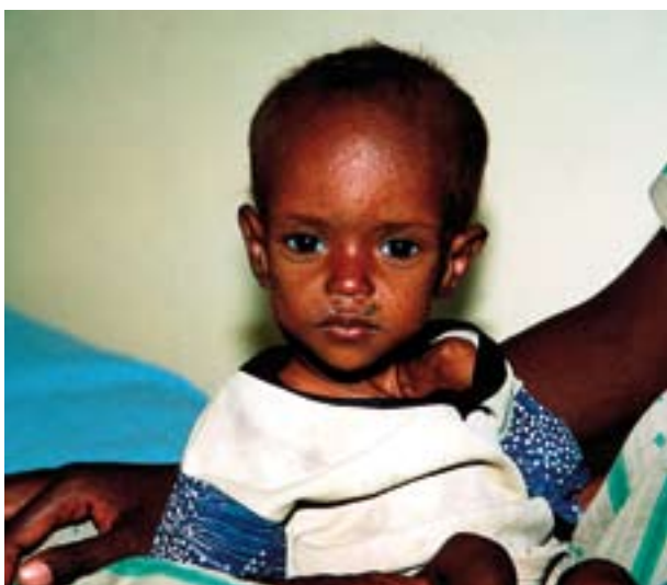
Child with AIDS and tuberculosis in Ethiopia