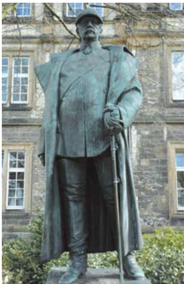
Social reforms to appease the masses. Bismarck monument in Bielefeld.

The cramped and, above all, unhealthy living conditions, insufficient nutrition and poor working conditions encouraged the spread of tuberculosis. According to a handbook on social hygiene written in 1912: “And because these conditions are mostly lacking in the classes of society who rely on manual work