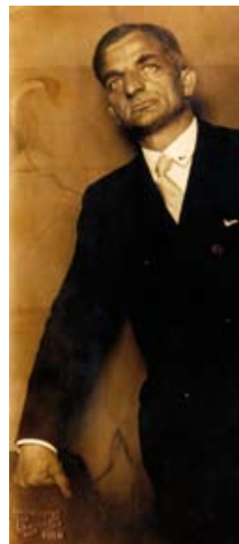
Joachim Ringelnatz died of tuberculosis in November 1934