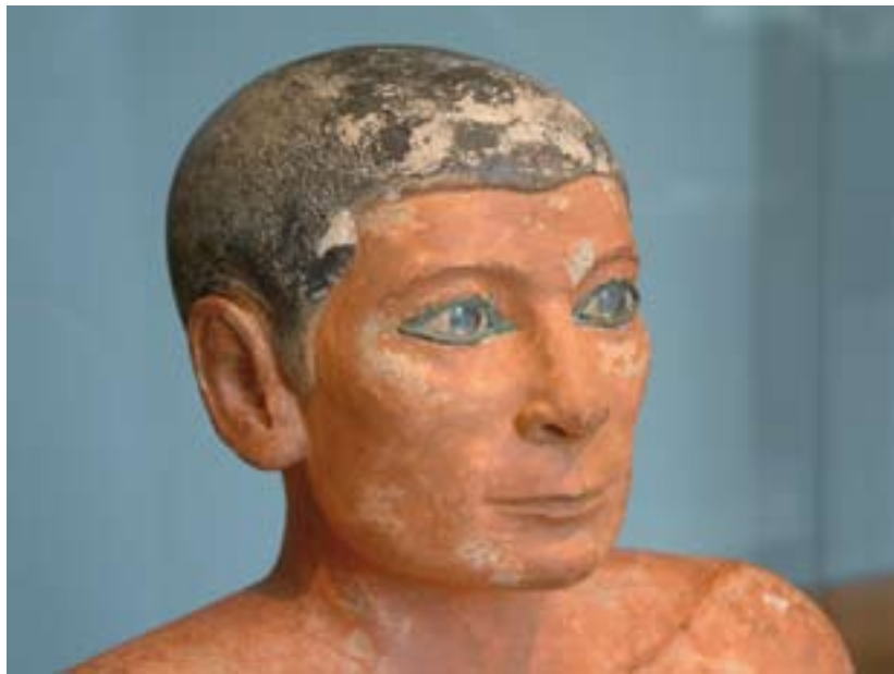
The Egyptian sculpture "The Writer" from the Louvre. Mummies from ancient Egypt document that even then a significant portion of the population suffered from tuberculosis.

Mycobacterium tuberculosis , the pathogen which causes tuberculosis is probably as old as mankind itself. Pulmonary tuberculosis could even be found in 5000 year old Egyptian mummies. Researchers determined that there was a comparatively low life expectation in Thebes, the capital of Ancient Egypt. The findings indicated that there was a widespread incidence of tuberculosis with half the population estimated to be carrying the tuberculosis bacterium. 1