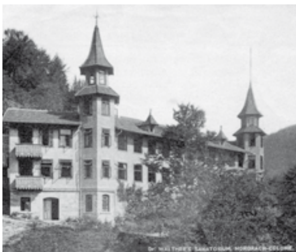
Many of the sanatoria were in idyllic locations. But the isolation was a problem for many. Dr. Walter's Sanatorium in Nordrach

Women with TB suffered particularly because of the disease for a number of reasons. Female workers in particular were advised to become sterilized as early as the period of the Second Reich if they became seriously ill with tuberculosis. Doctors frequently recommended termination of a pregnancy because of possible transmission of TB from the mother to the child. There was also the risk that latent TB could develop into active TB as a result of the pregnancy. For a long period of time pregnant women with tuberculosis were not admitted into sanatoriums because it was believed that there was no prospect of a successful cure. If a pregnancy was confirmed during a course of a cure then the woman was immediately sent home. The idea that pregnant patients required special care only gradually became accepted around 1914. 26