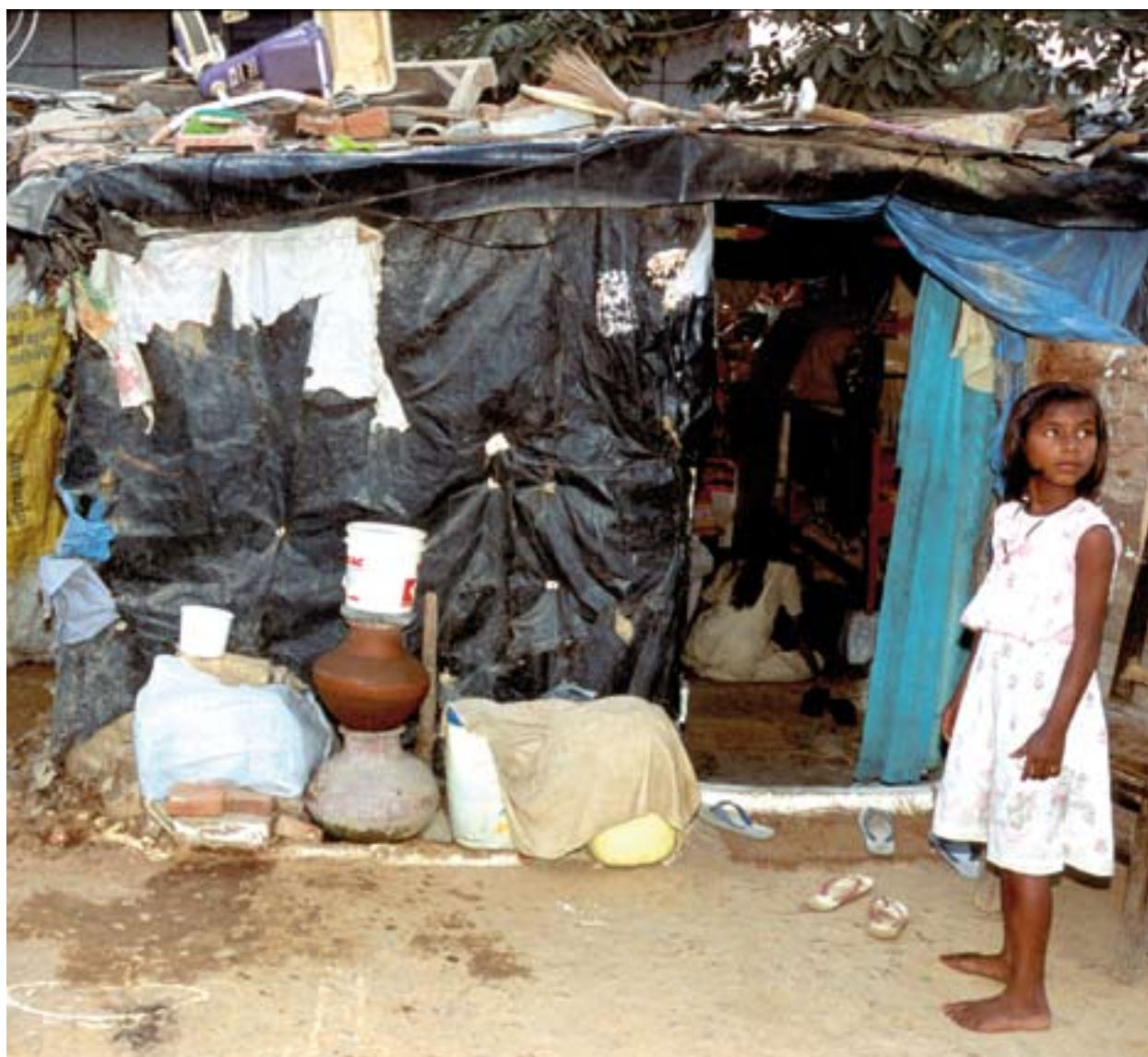
The fight against poverty is a milestone on the way of the eradication of TB.

Social, cultural and economic factors promote the spread of tuberculosis. Political strategies which get to grips with tuberculosis as a social disease are just as urgent as practical therapies. The fight against poverty, better chances of education, and gender equality – as targeted in the MDGs – are therefore milestones on the way to the eradication of TB.