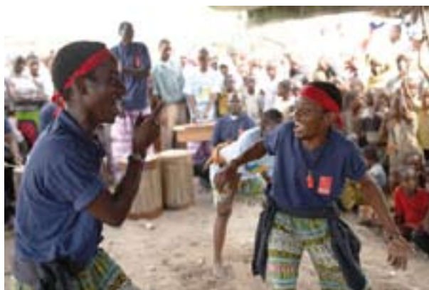
In the middle of the slums of Dar es Salaam in Tanzania men and women perform a play to educate people about AIDS and TB. The Pasada health project is supported by the DAHW.

Being stigmatized because of tuberculosis is very widespread and extends to all members of the sick person's family. The effects are harder for women than they are for men. It is not rare for women to be left by their husbands if they contract the disease, or they have scarcely any chance of getting married and the prospect of social protection associated with it. 62