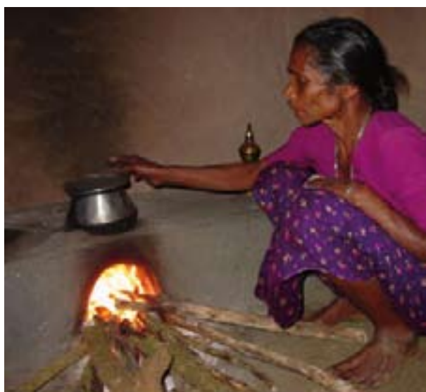
Smoke is a major health risk.

looking for TB cases. Or patients contact the next healthcare centre. In case of suspected bronchitis, they get antibiotics there. If cough, fever or diarrhea continues for more than three to four weeks, the patients are hospitalized. There, we make a sputum test and may also prepare a culture. We can make X-ray pictures in another hospital. Then we start therapy. As soon as we know that the patients tolerate the drugs, their treatment continues at home. Unfortunately, they cannot remain hospitalized for cost