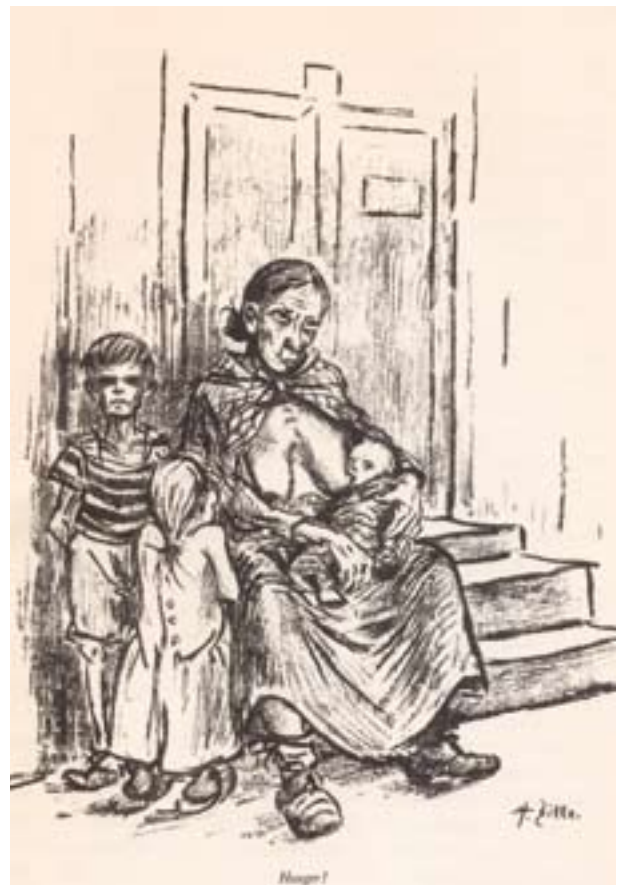
Heinrich Zille: Famine

Here there are some astonishing parallels which can be drawn; the situation of sick people in Germany around 100 years ago in some ways resembles the life of patients in poor countries today.