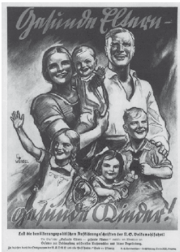
The National Socialists raised health to the status of a fundamental dictum. Propaganda poster of the NS People's Welfare

The measures included, amongst other things, the withdrawal of public support for people suffering from TB who refused to take a cure in a sanatorium. Even completely normal TB sufferers who, lived orderly lives could suddenly be stigmatized as an 'antisocial sick person', if they refused to undertake a cure.