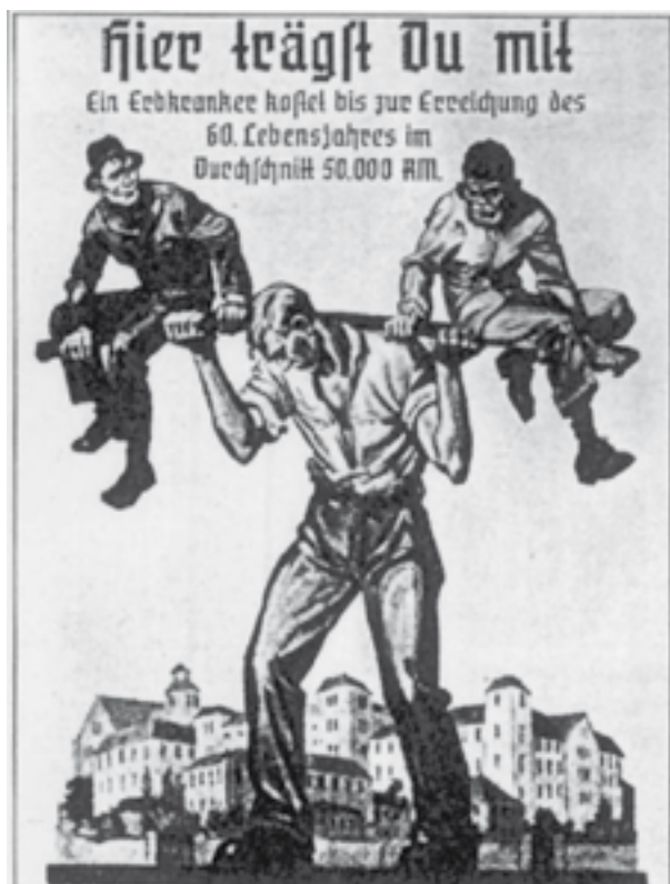
All sick people were regarded as "damaging to the people's community". Nazi propaganda poster

Tuberculosis sufferers were also labelled as carriers of 'inferior genes' and had to be excluded from the reproductive process as far as possible. It was necessary: 'To evoke the old instinctive aversion to marrying into families with tuberculosis and to warn