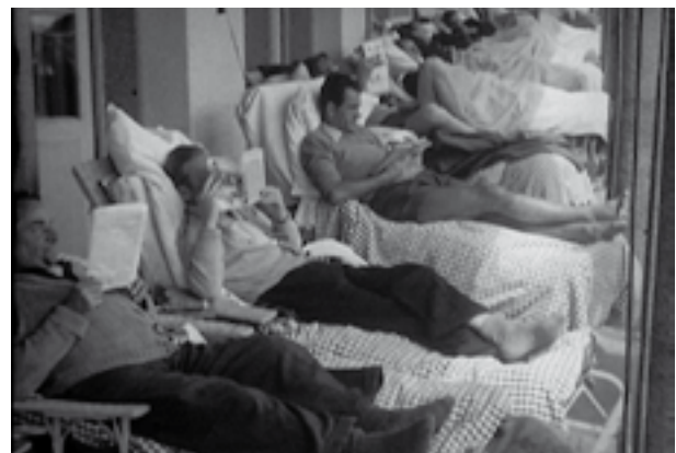
For a long time, rest cures were the core of tuberculosis therapy in Germany.

Since the end of the 1880s people’s sanatoriums were established to admit poorer people with pulmonary diseases. The sanatoriums were intended to strengthen the patients both physically and mentally, and to restore their physical powers of resistance. Most of all they were to provide education about hygiene and preventative measures to be taken against epidemics.