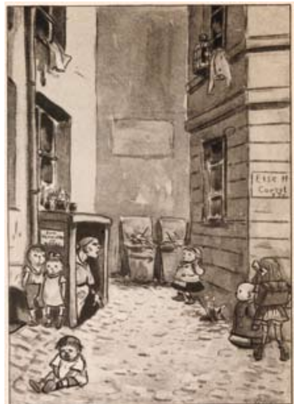
Heinrich Zille: Get away from the flowers and play with the bins!

her four children were sitting on the ground as they all ate boiled potatoes which had just been cooked in a black cooking pot; this was their midday meal without anything to accompany the potatoes.’ 6