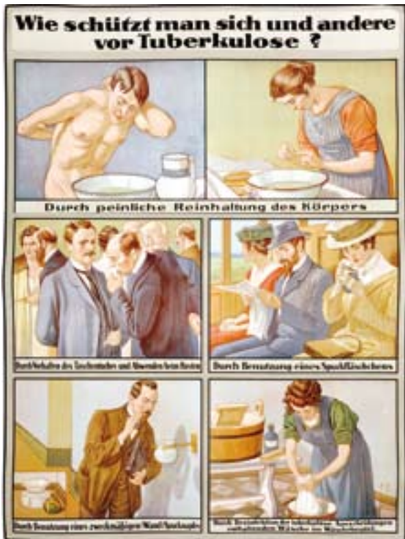
“How do you protect yourself and others from tuberculosis?” Poster from the 1930s propagated by the German Hygiene Museum. The posters were to be placed in highly frequented places such as schools, factories and hospitals.