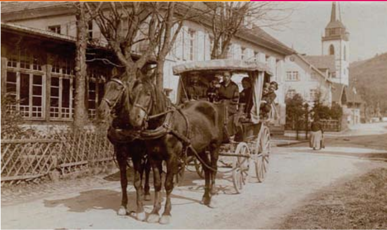
The sanatorium patients were picked up from the train station with horse drawn carriages.