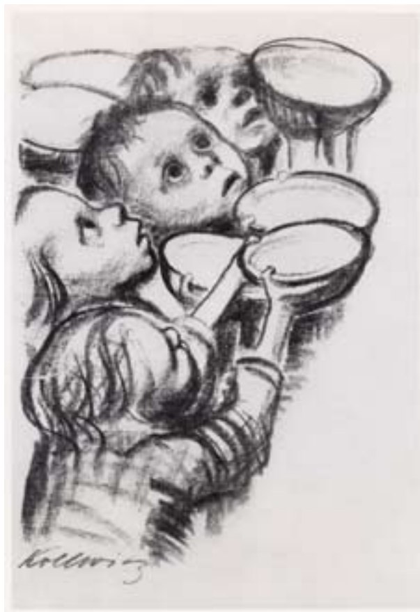
Käthe Kollwitz: Germany's children are starving!

of the amount supplied in peace time. Milk had already become rationed by October 1916 after the supply for Berlin had dropped to 30% of the amount required. There then followed the rationing of eggs, cheese, sugar, fish; shortly afterwards all foodstuffs had gradually become rationed, so that one could justifiably speak of a rationed famine... If the conditions for obtaining nutriment were tolerable until spring 1916, then they became ominous after the winter of 1916/17 following a poor harvest of both grain and potatoes. 8 The poor nutritional situation endangered not only healthy people,