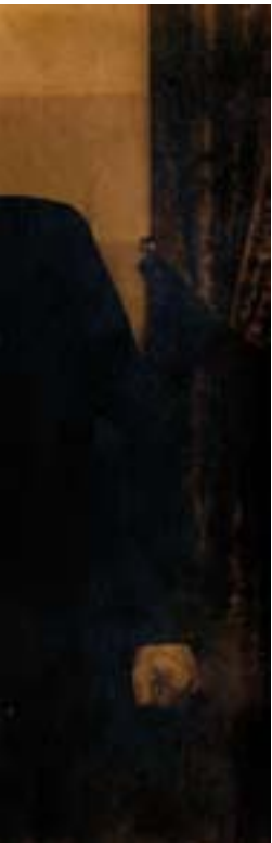
on the 17th of ulosis