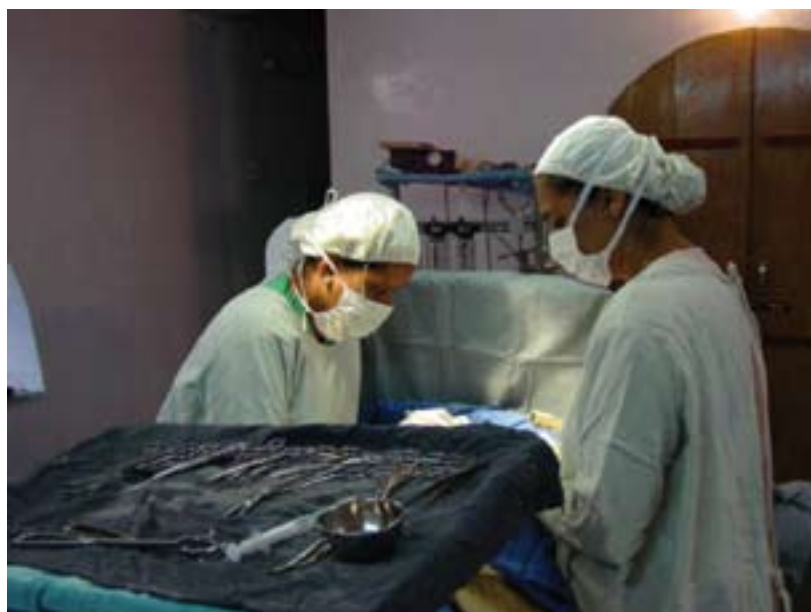
Operation in the Adivasi Hospital

The hospital and the entire healthcare program contributed significantly to the social change for the Adivasis. Here, non-Adivasis have to follow the rules of the otherwise despised Adivasis. Men and women, e.g., are accommodated together in the hospital rooms, unthinkable among the rest of the Indian society. The Adivasis, the lowest rank of the Indian society structure, have the best